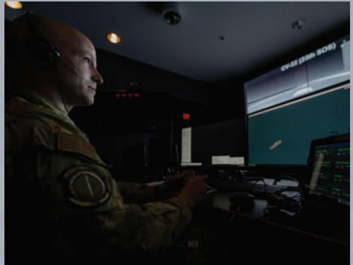
An AC-130J weapons systems officer prepares for the joint virtual simulation training event as part of the annual Emerald Warrior exercise at Hurlburt Field, Florida, April 26, 2023. The joint, combined training executed in Emerald Warrior continues to build and strengthen relationships with our allies and partners, establishing a common sight-picture for operations around the globe.