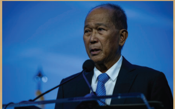
(Middle right) Maj. Gen. (retired) Delfin Lorenzana, former minister of defense Philippines, speaks to an audience during Special Operations Forces Week in Tampa, Florida, May 11, 2023.