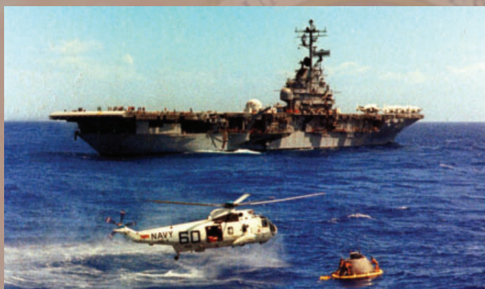
Recovery swimmers assigned to Underwater Demolition Team 11 rehearse the recovery of Apollo Spacecraft in San Diego Bay. The practice of anticipating and rehearsing contingencies remains a crucial aspect of contemporary special operations mission planning and execution.

“That little thing called ‘to serve’, where we didn’t have enough SEALs to go into combat for Afghanistan and Iraq,”