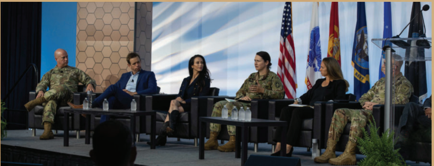
Members with Global Special Operations Forces and U.S. Special Operations Command conduct a panel on Total Human Performance: Today and Tomorrow, during SOF Week in Tampa, Florida, May 9, 2023.