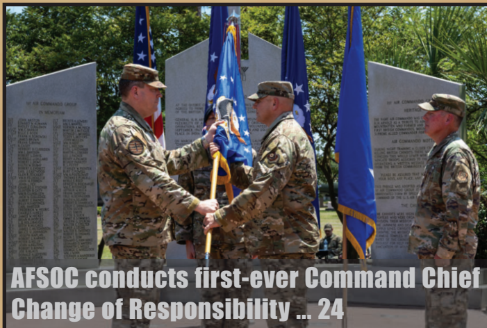
AFSOC conducts first-ever Command Chief Change of Responsibility ... 24