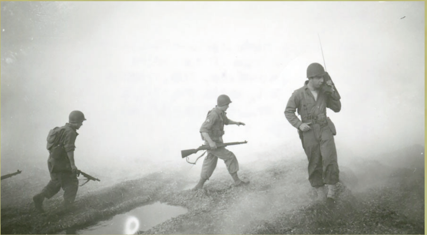
Under cover of smoke, a Ranger officer coordinates maneuvers via radio on the beach in Algeria on Dec. 20, 1942.