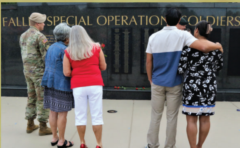
Gold Star family members gaze upon the Memorial Wall at the U.S. Army Special Operations Command Headquarters following the annual Gold Star Memorial Day Ceremony at Fort Bragg, North Carolina, May 25, 2023.

1,242 names on this wall, heroes who have fallen in support of this great nation. I'm especially pleased to welcome our most honored guests – our Special Operations Gold Star family members.”