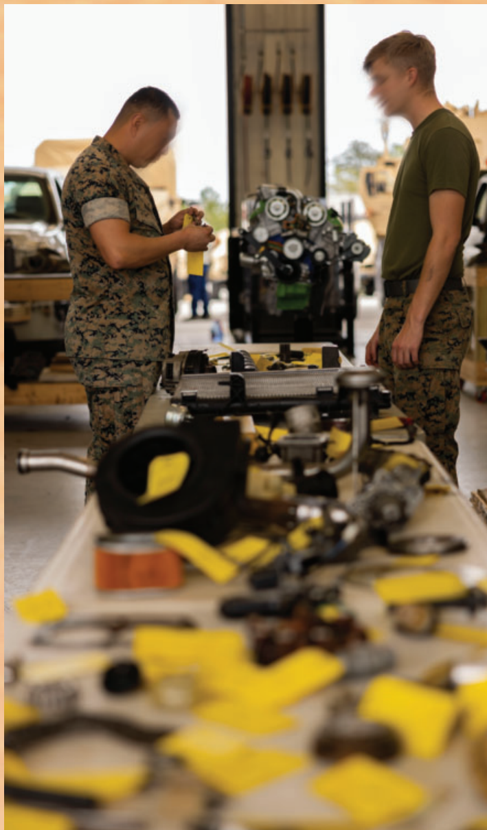
Marines with Marine Forces Special Operations Command and the Fleet Marine Force conduct practical application during the MARSOF Maintenance portion of the Multi-Discipline Logistics Operations Course at Camp Lejeune, North Carolina, March 28, 2023.

The MARSOC graduates of MDLOC will go on to be assigned to Marine Raider Support Teams with the unique skills needed to support and sustain Marine Special Operation Companies.