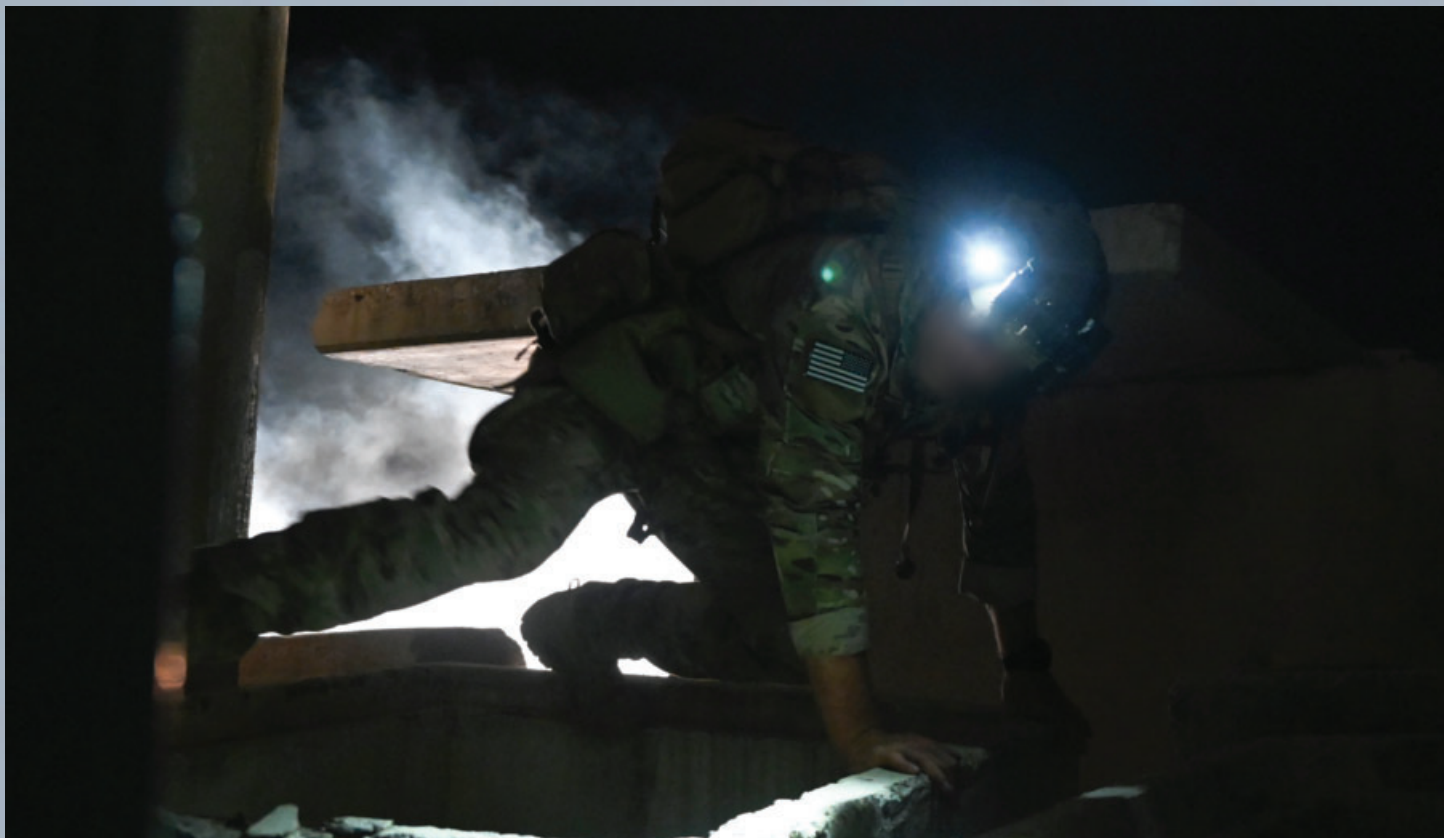
A Special Tactics operator with the 24th Special Operations Wing plays as blue force, searching the collapsed structure for survivors as part of Emerald Warrior 23 at Camp Santiago, Puerto Rico, May 1, 2023. Emerald Warrior is the largest joint special operations exercise involving U.S. Special Operations Command forces training to respond to various threats across the spectrum of conflict.