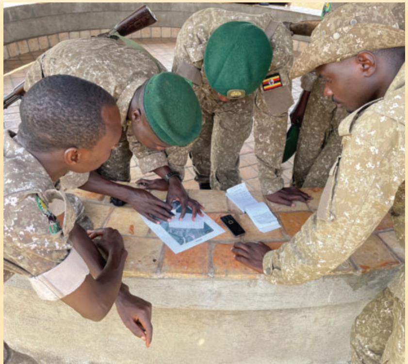
Uganda Wildlife Authority Park Rangers plan their next movement during the land navigation practical exercise.

The UWA is a Ugandan government agency that aims to conserve, manage and regulate Uganda’s