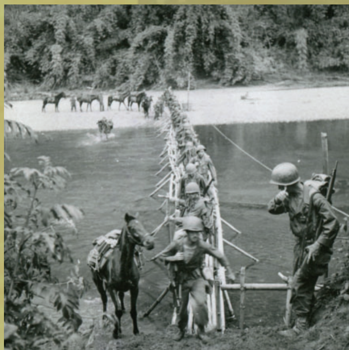
Soldiers from the 5307th Composite Unit (Provisional), popularly known as Merrill's Marauders, cross a bridge over the Chindwin River in Northern Burma on March 17, 1944.

In the China-Burma-India Theater of Operations, another legendary Ranger lineage unit was organized on Oct. 3, 1943: the 5307th Composite Unit (Provisional). Better known as "Merrill's Marauders" after its commander, Brig. Gen. Frank D. Merrill, the 5307th, a Long-Range Penetration Group, fought a grueling campaign in the mountainous jungles of Burma that lasted until mid-1944. Following the capture of Myitkyina, Burma, the remnants of the 5307th were consolidated with the 475th Infantry Regiment on Aug. 10, 1944. The 475th was part the second Long Range Penetration Group formed for service in Burma, the 5332nd Brigade