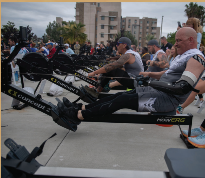
Team SOCOM competes in the rowing competition during the 2023 Warrior Games Challenge June 7, 2023, San Diego, California.