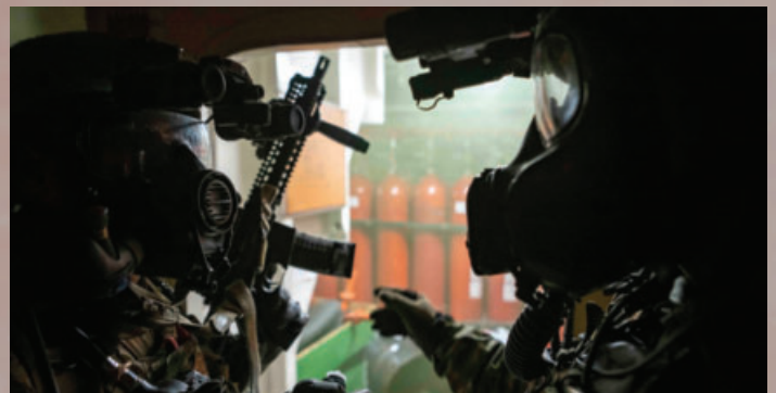
East coast-based Naval Special Warfare Operators (SEALs) clear a space of a training vessel during a maritime interdiction operation training exercise in a simulated chemical, biological, radiological environment.

The Navy SEALs’ commitment to constant training and refinement is a testament to their reputation as the premier global maritime commandos.