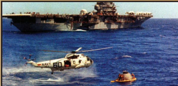
SEAL Team 5 celebrates 40th year ... 18