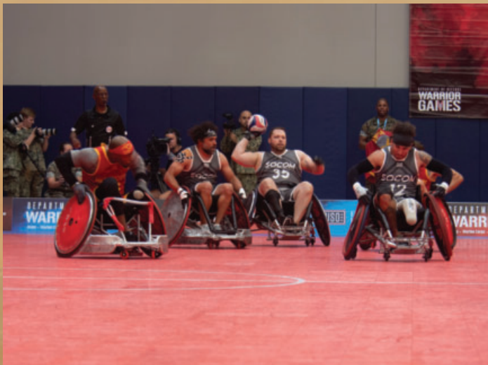
Team SOCOM plays in the Bronze Medal Wheelchair Rugby match during the 2023 Warrior Games Challenge, San Diego, California, June 6, 2023. Team SOCOM would go on to win.